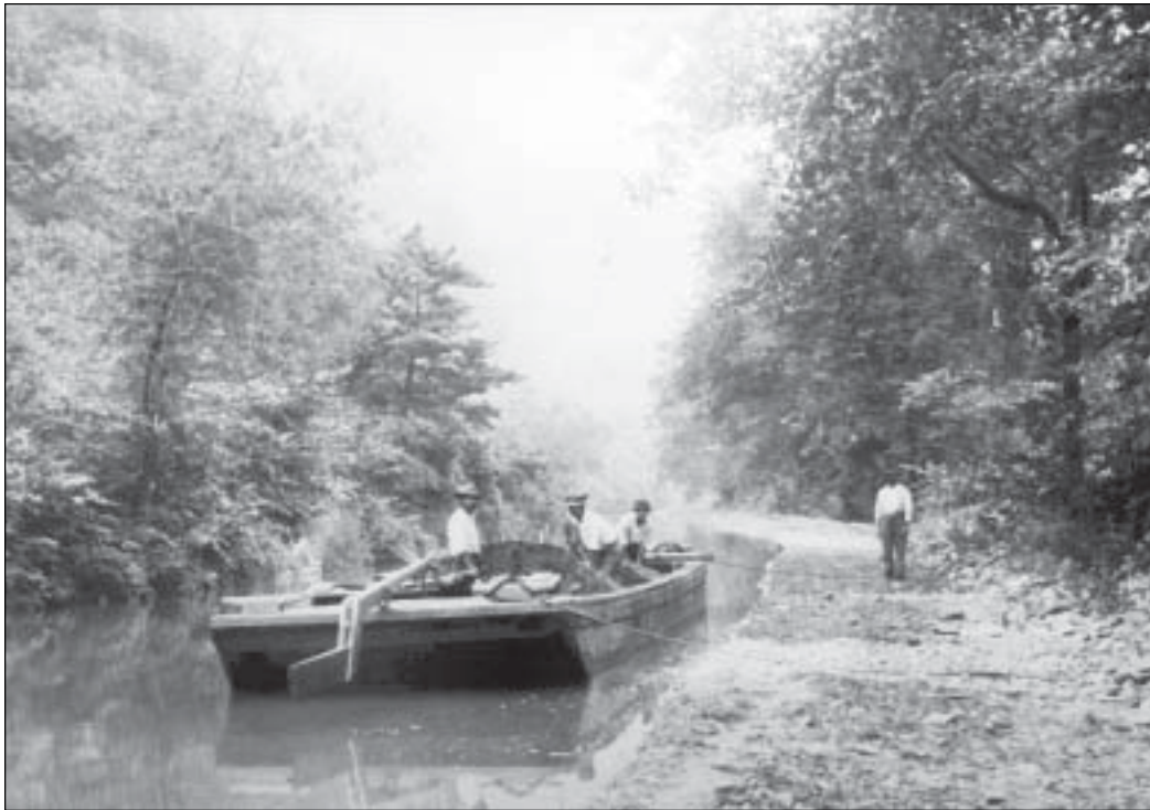
Repairing the towpath in the 1930's. Quite a contrast to the ways in which today's repairs are done.