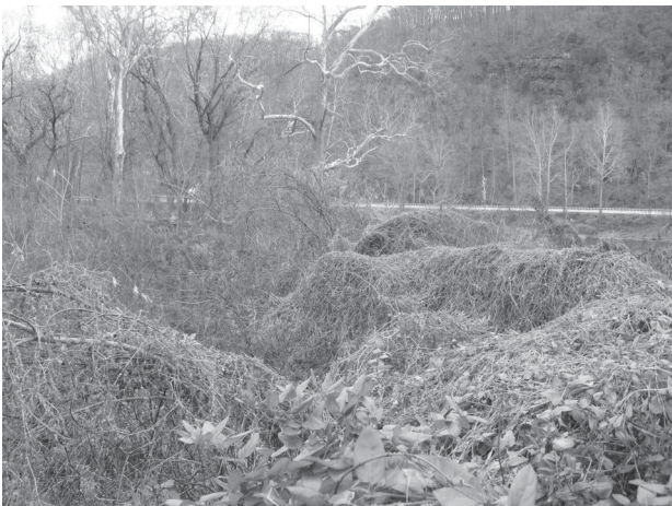
Sherwin Williams paint isn't the only thing that covers the earth. Here mile-a-minute and honeysuckle rule the land.

Our “new” Canal will need us to be watchful, so please come out and become a better-informed Friend.