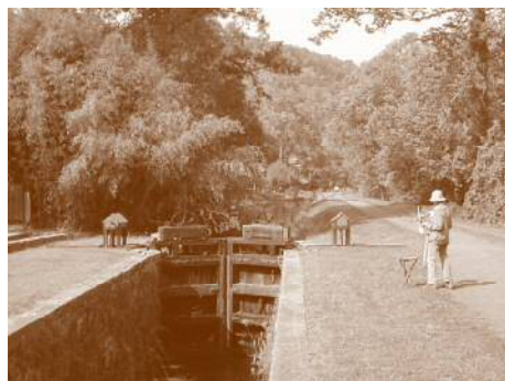
Then and now, the Canal lures artists with their easels.

Don’t miss this opportunity to see the Canal in so many different ways.