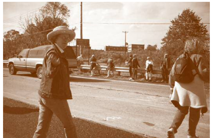
Crossing the four lanes of Route 13 during a Canal Walk isn't easy! The sooner the northern tunnel and the southern pedestrian improvements are completed the better.