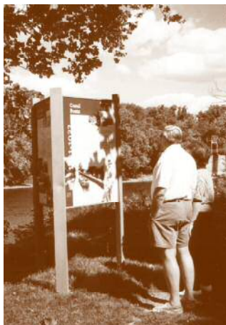
Help get the Canal's signs back in shape

With your help, visitors again will be able to learn about the history of the Delaware Canal from "Mules and Men" to "Citizens to the Rescue."