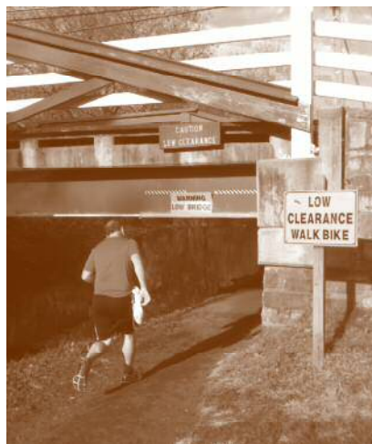
It's hard to run a marathon while singing "Low Bridge, Everybody Down."